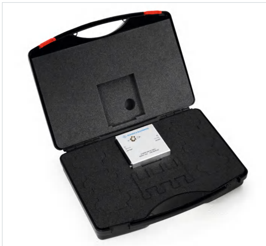
R&S®ENY81-CA6 base unit in carrying case.

1) The calibration data includes asymmetrical impedance and phase, voltage division factor, decoupling attenuation, longitudinal conversion loss (LCL), transmission bandwidth and crosstalk.