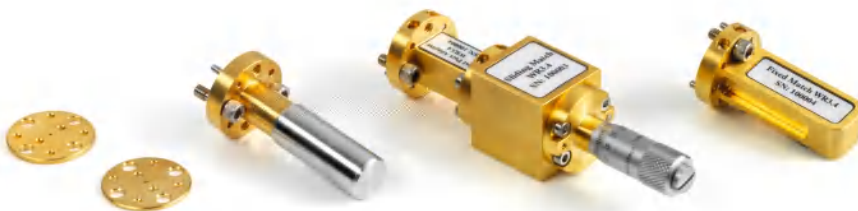
R&S®ZV-WR03 waveguide calibration kit for calibration up to 330 GHz.

Calibration can be performed using the appropriate R&S®ZV-WRxx or R&S®ZCWMxx waveguide calibration kit. The characteristic data of the calibration kit standards is stored in the analyzer firmware and is automatically loaded when an R&S®ZV-WRxx is selected. The calibration kit contains the following standards: short, shim, shim 2 (in some calibration kits only), fixed match and, optionally, sliding match. When connected together, the shim and short calibration standards form an offset short. The through standard is implemented by connecting the two waveguide outputs of the converters with each other. A sliding match can be used instead of the fixed match. Rohde&Schwarz offers two versions of the calibration kit – with and without a sliding match.