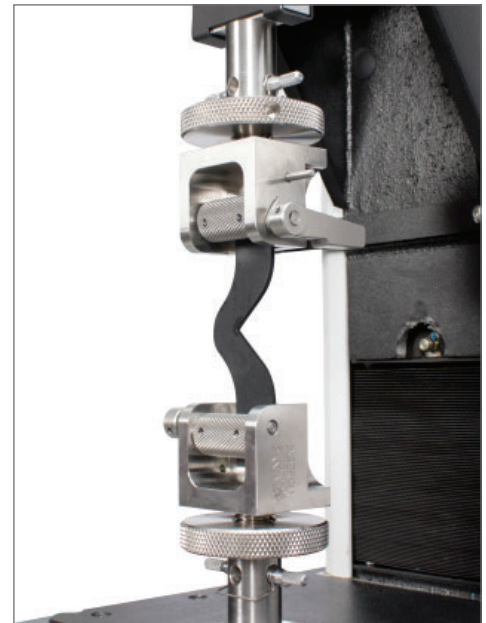
2713-004 Self-Tightening Roller Grip