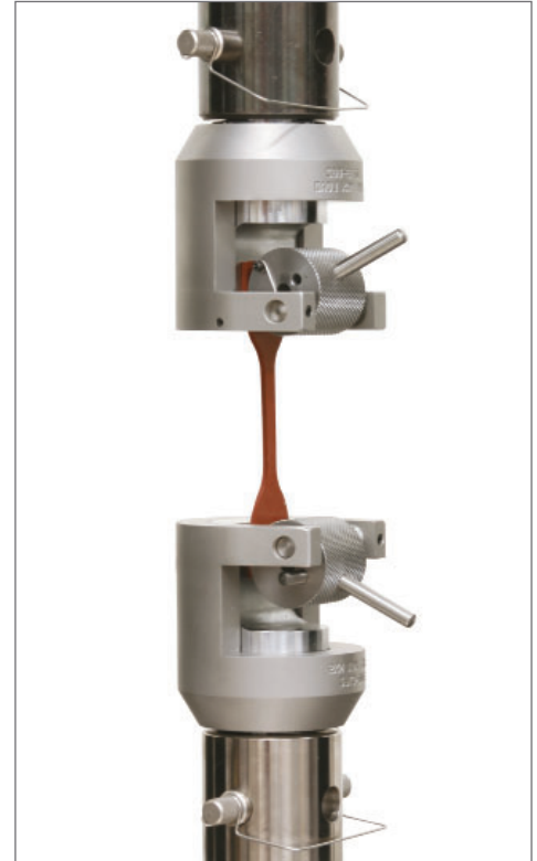
2713-002 Self-Tightening Roller Grip