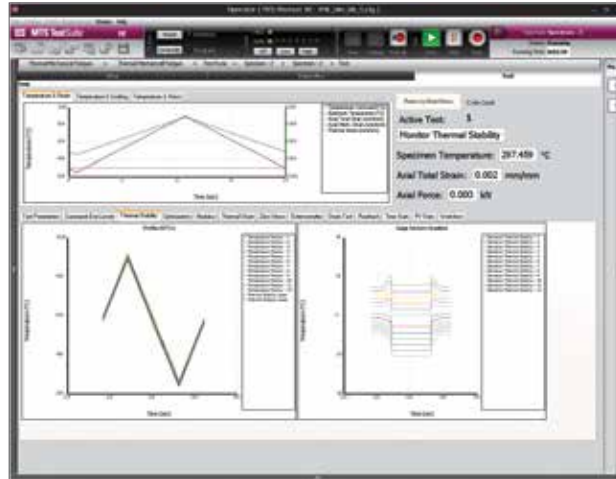
The Runtime View of thermal stability at batch level offers simple validation that the temperature gradient has been achieved

When your test is complete, the software can create a report against a pre-defined template. Reports can include all input information and measurements, and they can be amended with user-entered calculations based on reported values. The optional Fatigue Analyzer provides additional insight into your post-test data, including detailed temperature-versus-cycles analysis.