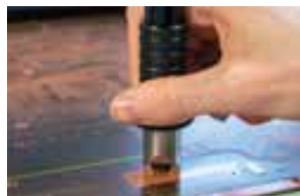
Special probes for different measurement ranges