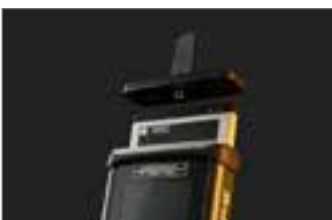
Quick change battery