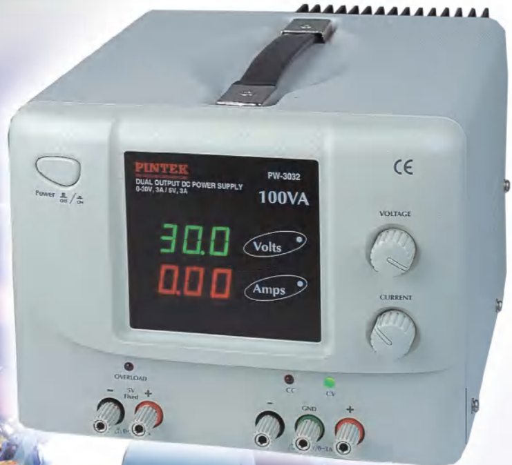
PW-3032 Low Ripple & Noise