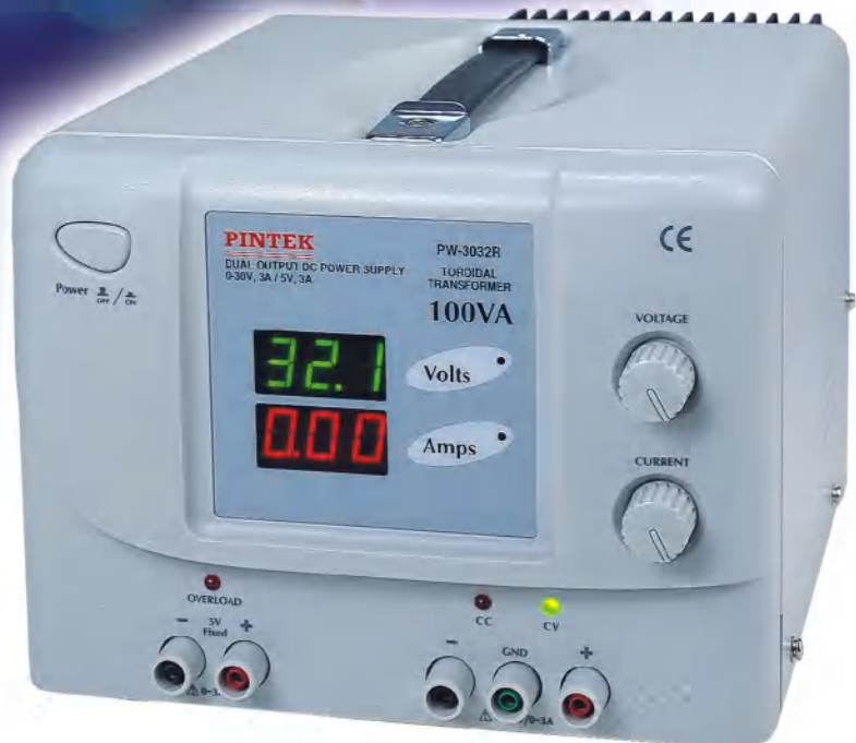
PW-3032R Toroidal Transformer Low EMI & High EMS Very Low Ripple & Noise