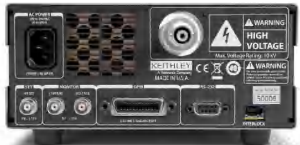
2290-10 rear panel showing the IEEE-488 interface connector, RS-232 interface connector, high voltage output connector, analog control/output connectors, and interlock connector.