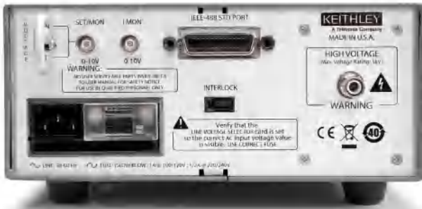
2290-5 rear panel showing the IEEE-488 interface connector, high voltage output connector, analog control/output connectors, and interlock connector.

The Series 2290's IEEE-488 interface allows the creation of an automated high voltage test system. Software drivers are supplied to simplify and accelerate test system development. This further enhances safety as the high voltage can be controlled from a remote location.