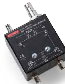
The 2290-PM-200 Protection Module protects low voltage measurement equipment from voltages greater than 200V.

Series 2290 Power Supplies and a 2290-PM-200 SMU Protection Module protect both user and instrumentation from hazardous voltages. An interlock circuit built into the power supplies can be used to ensure that the output voltage is disabled if a high voltage test fixture access door is open. In addition, all Series 2290 power supplies have low voltage analog outputs to permit safe monitoring of the high voltage and the output current.