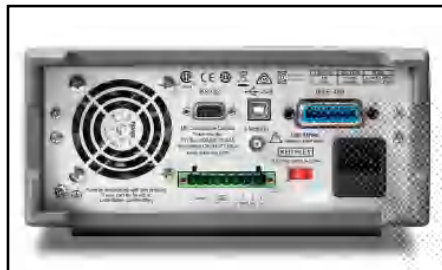
Model 2380-500-15 rear panel