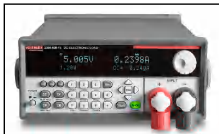
Model 2380-500-15 front view showing the safety covers on the input terminals.