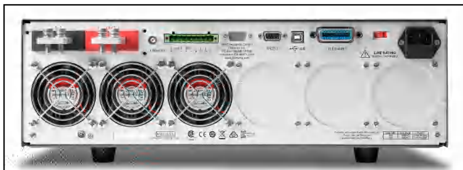
Model 2380-500-30 rear panel