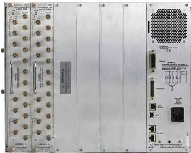
707B rear panel

Prefer to create your own customized application software? Native National Instruments Labview®, IVI-C, and IVI-COM drivers are available for downloading to simplify the programming process. For the Labview® driver please visit www.ni.com ; for IVI drivers please visit www.tek.com .