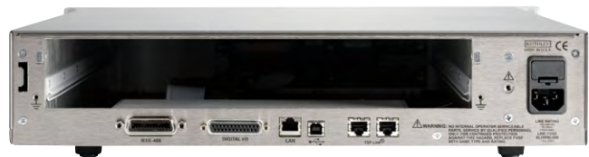
708B rear panel