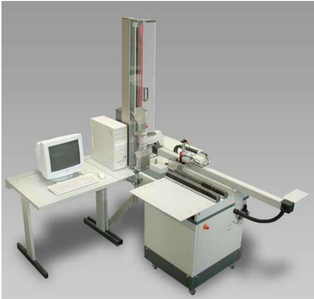
Robotic testing system 'roboTest L' with testing machine 2.5 kN