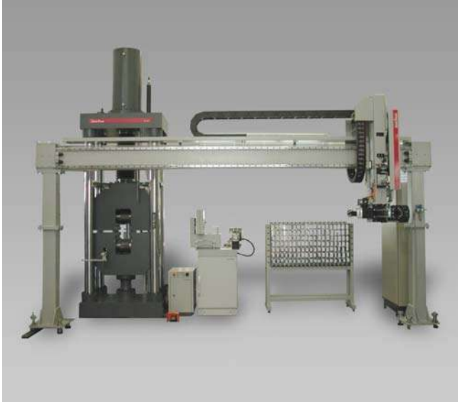
Pic 1: Robotic testing system 'roboTest P'