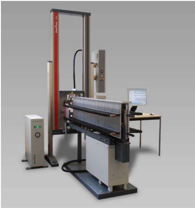
Robotic Testing System 'roboTest F'