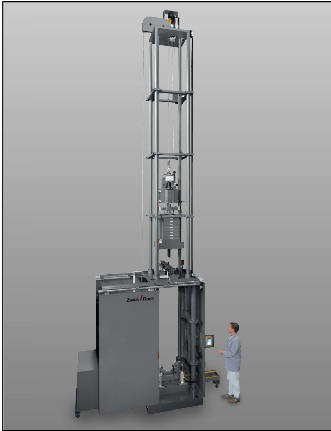
ZwickRoell high energy drop weight testers DWT40 with 5 m drop height