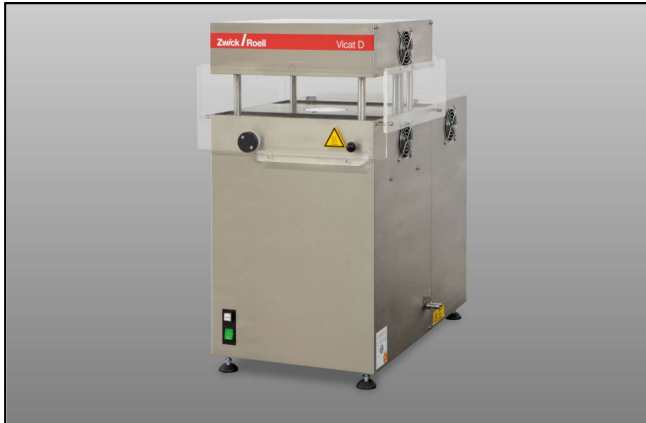
Vicat Dry 2-300-D