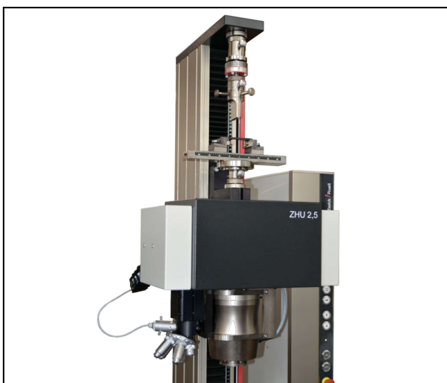
ZHU/zwickiLine+ with the option second test area