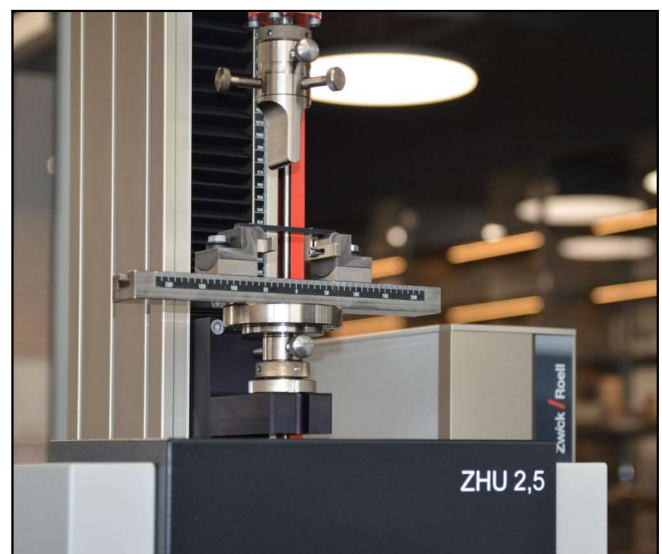
3-point-bending test on plastics