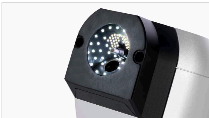
The dosing outlet inside the measuring head produces a water drop with an accurately adjusted volume.

QC inspections for pretreated or cleaned materials that simply always succeed without prior knowledge: with Ayríís, assessments of drop images or pre- and post-processing for difficult surfaces are a thing of the past. The technologically new 3D Contact Angle method provides an accurate and definite measurement value. Taking a measurement is correspondingly simple: Place Ayríís, click, and read off the unmistakable result in seconds.