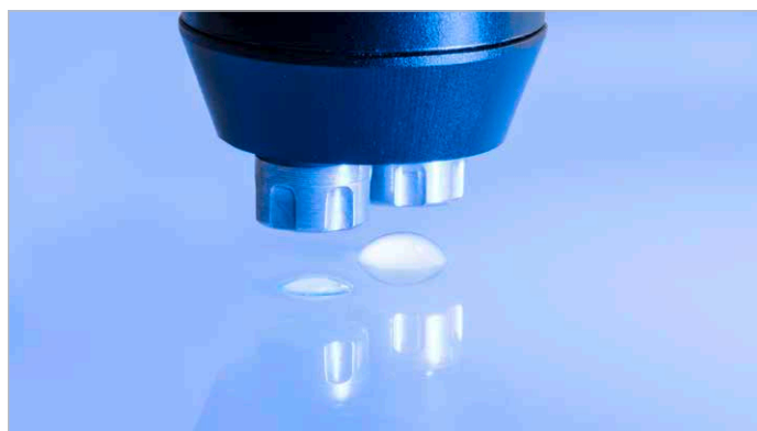
SFE measurement with two drops using the Liquid Needle