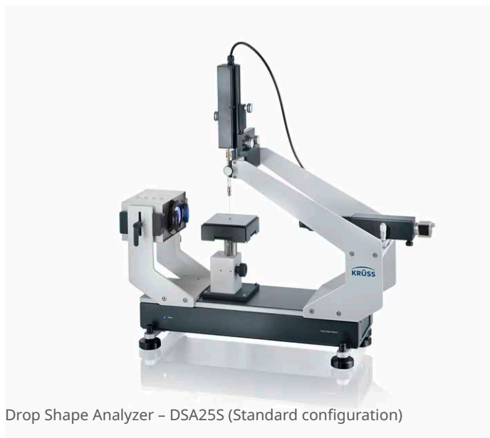
Drop Shape Analyzer – DSA25S (Standard configuration)

The DSA25 features a high-resolution camera and a quality zoom lens for accurate display of the drop with optimum size. The high image quality that this achieves leads to a precisely measured contact angle or surface tension. Combined with the intelligent image evaluation algorithm of the ADVANCE software, drop shape analysis with the instrument provides exact results.