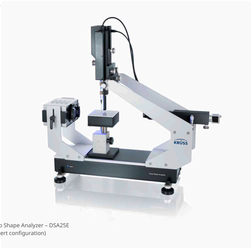
Drop Shape Analyzer – DSA25E (Expert configuration)