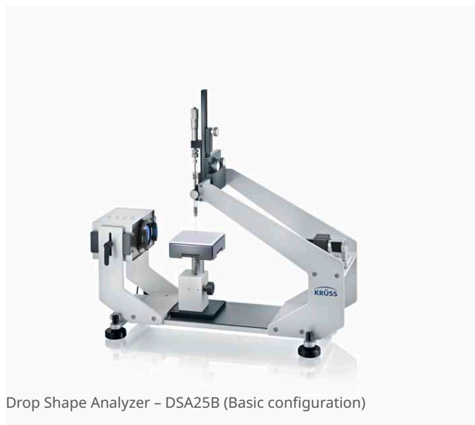
Drop Shape Analyzer – DSA25B (Basic configuration)