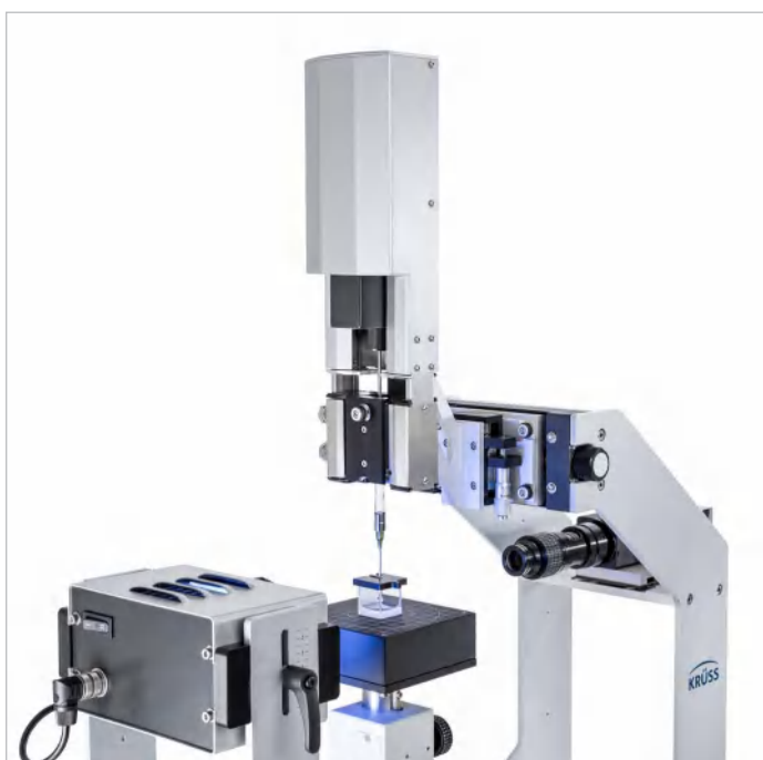
Oscillating Drop Module – ODM of the DSA30R

The dosing unit's extremely precise piezo drive enables exact sine waves in a frequency spectrum of 0.001 to 20 Hz, so the measurements cover a very wide dynamic range.