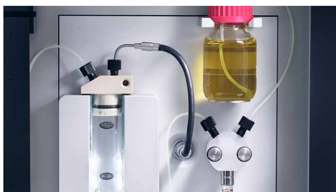
Fully automatic liquid dosing for investigating two-phase systems

In the drop volume method, a liquid is introduced into a bulk phase through a capillary. As a result of the interfacial tension, the drop tries to keep the interface with the bulk phase as small as possible. As a new interface comes into being when the drop detaches from the capillary outlet, it is necessary to overcome the corresponding interfacial tension. The drop does not detach until the lifting force or weight compensates the interfacial tension. This means that, knowing the density difference between the phases, the interfacial tension can be calculated from the volume. Drop detachment is detected using a light barrier and the volume is known due to the precisely set flow rate.