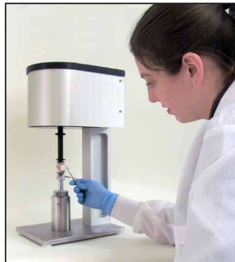
ElectroForce® 5500 Test Instrument

In addition to force and displacement sensors, a Digital Video Extensometer (DVE) can be incorporated to monitor and control strain based on Green-Lagrange calculations. The DVE includes a digital video camera, camera stand and LED light to record the movement of markers on a sample during loading. Video capture and analysis software are included for real-time calculations and monitoring of primary, secondary and shear strains.