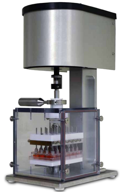
24-Well Plate Compressive Loading Fixture with the ElectroForce® 5500 Test Instrument

The base test system contains a telescopic shaft so that samples of various sizes can be mounted in the adjustable test space. This standard shaft can also be removed to accommodate larger fixtures and chambers, such as the 24-well plate fixture for compressive loading. This removable multi-specimen fixture includes an enclosure so that samples can be mounted under a flow hood before the fixture is transferred to the test system. Rows of compression pins can be locked in the retracted state for unloaded control samples. The maximum sample height per well is 5 mm and each platen assembly weighs 5 grams with pins in the unlocked state.