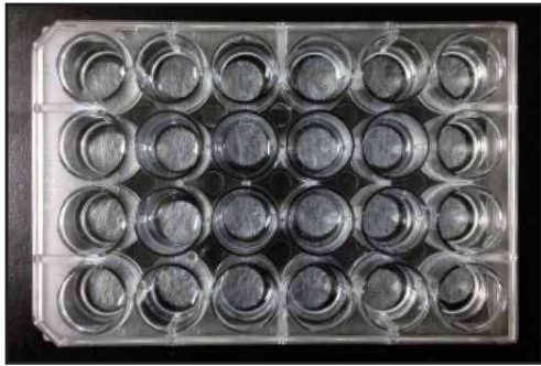
24-Well Plate with Hydrogel Disc Specimens

The ElectroForce® 5500 test instrument is designed to fit inside of a standard cell culture incubator, and all cables fit through a standard incubator port. The test frame features an overhead motor so that any spills can be easily cleaned without damage to the system. To ensure sterile contact with the sample, autoclavable fixtures are available, such as tensile grips, compression platens and bend fixtures. The system features standard mounting threads and can be easily adapted to accommodate customer-provided bioreactor chambers and fixtures. The sleek, clean design and compact size of the 5500 test instrument is well-suited for the testing and stimulation of biological constructs inside of a cell culture incubator.