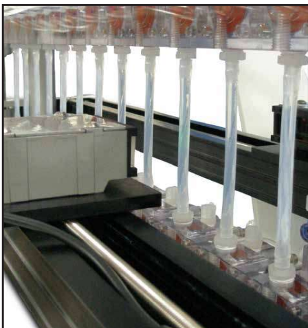
Laser micrometer for measurement and control of pulsatile distension