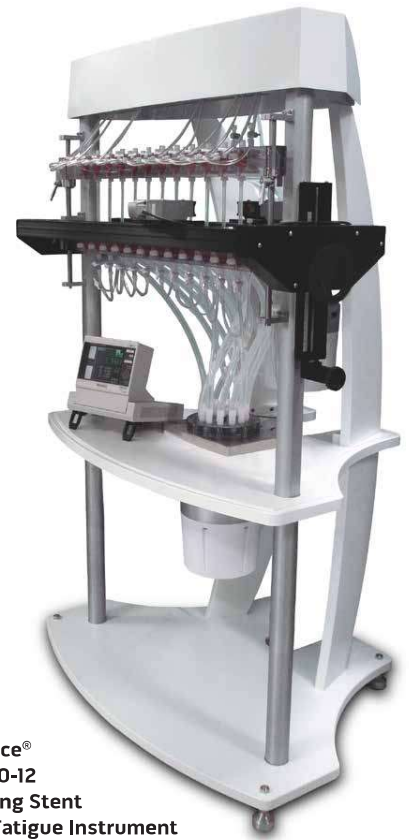
ElectroForce® Model 9210-12 Drug-Eluting Stent Pulsatile Fatigue Instrument