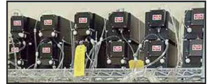
Interface to Real-Time Particle Counting

Real-time particle counting may be added to the system at any time. The ElectroForce® 9210-12 instrument has been tested using commercially available laboratory quality laser counters and counting software. The 9210-12 instrument is also available as an attractively-priced base configuration for those situations where there isn't an immediate need for particle capture or real-time particle counting. The base system provides high-frequency pulsatile distention testing for up to 12 specimens, and then the system can be upgraded in the future. Please contact the ElectroForce Systems Group for more information.