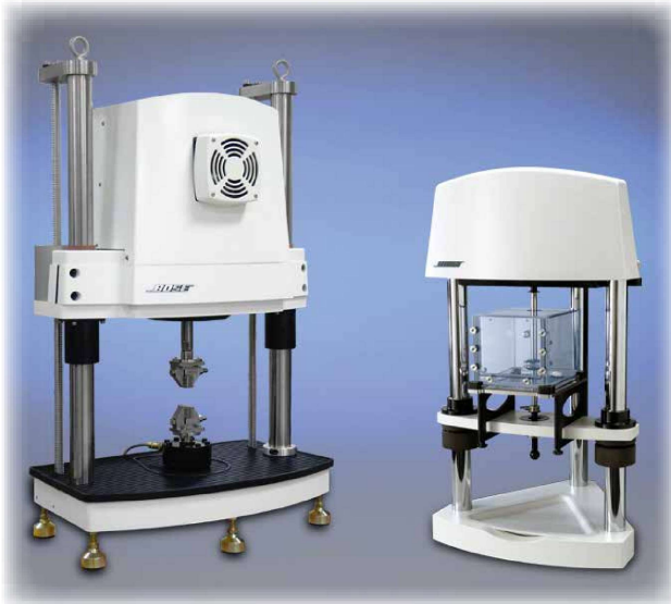
ElectroForce® 3330 (left) and 3200 (right) Series II Test Instruments

Absolute displacement measurement – High resolution and absolute measurement with a single sensor