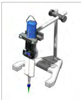
Optional stand mount (P/N 7015875)