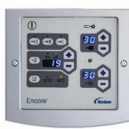
Encore LT Automatic Controller