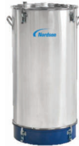
Automatic refill hopper

For more information, speak with your Nordson representative or contact your Nordson regional office.