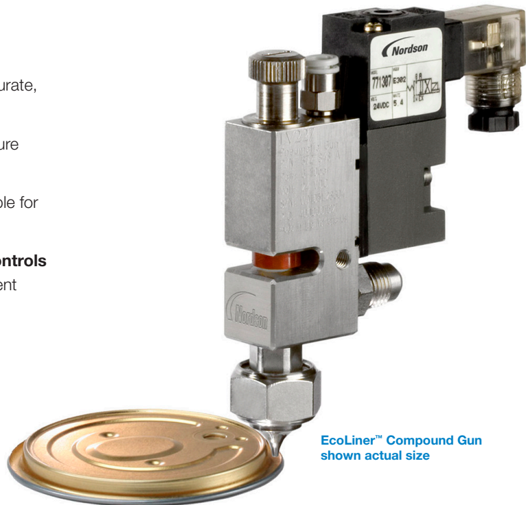
EcoLiner™ Compound Gun shown actual size

An integrated needle-stroke adjustment permits accurate control of material volume and pattern repeatability.