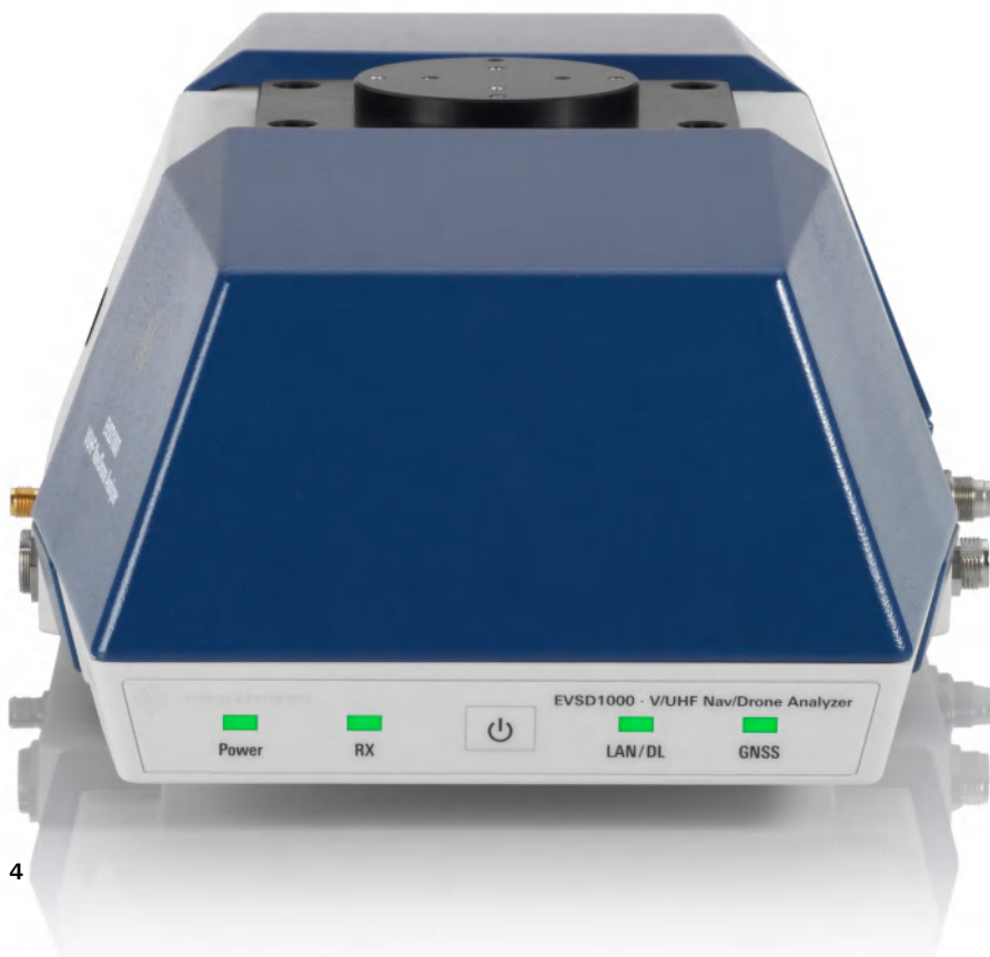
Front view of the R&S®EVSD1000 with power switch and status LEDs switched on.

The R&S®EVSD1000 automatically measures and decodes the identifier for a station under test and returns the ID pulse repetition rate, the ID code and the dash, dot and gap lengths.