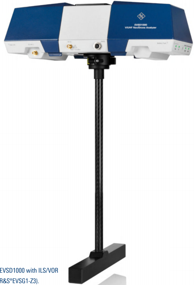
The R&S®EVSD1000 with ILS/VOR antenna (R&S®EVSG1-Z3).

R&S®EVSG1-Z11 verification test software lets users independently perform verifications. The software is run on an external PC and performs all the necessary and time-consuming measurements and automatically generates test reports.