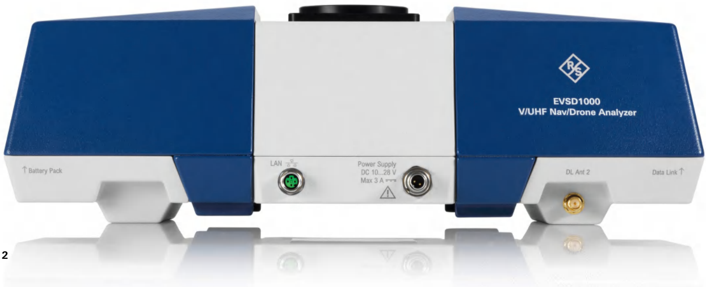
Side view of the R&S®EVSD1000 with connectors for LAN, power supply and one of the data link antennas.

The R&S®EVSD1000 is very compact with a robust mechanical design and excellent signal processing sensitivity, making it ideal for use in measurement drones. Spectrum and signal analysis options as well as a time domain analysis option are also available. At 1.5 kg, the R&S®EVSD1000 can be used on a medium-sized drone for measurements of ILS/VOR systems in line with the ICAO standards.