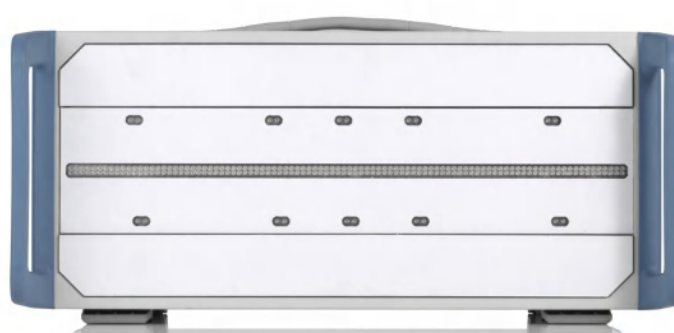
R&S®QAT-B11 standard frontend