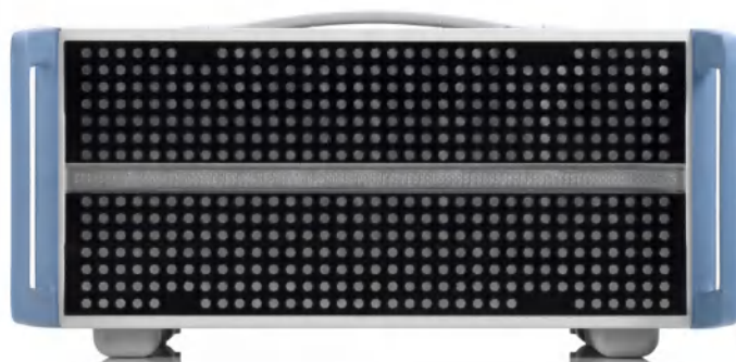
R&S®QAT-B21 single-line MIMO frontend

1) For options installed, the remaining base unit warranty applies if longer than 1 year. Exception: all batteries have a 1 year warranty.