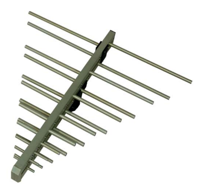
Figure 1.1 ALC-100 Log Periodic Antenna