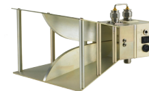
AHA-118 Active Horn Antenna (1-18 GHz)