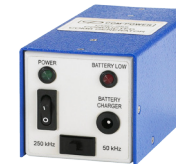
CGC-255E Conducted Comb Generator