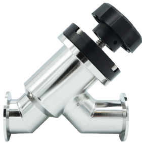
HV Inline valve, DN 16 ISO-KF, manual, SS/FKM, "A"-dim.102 mm